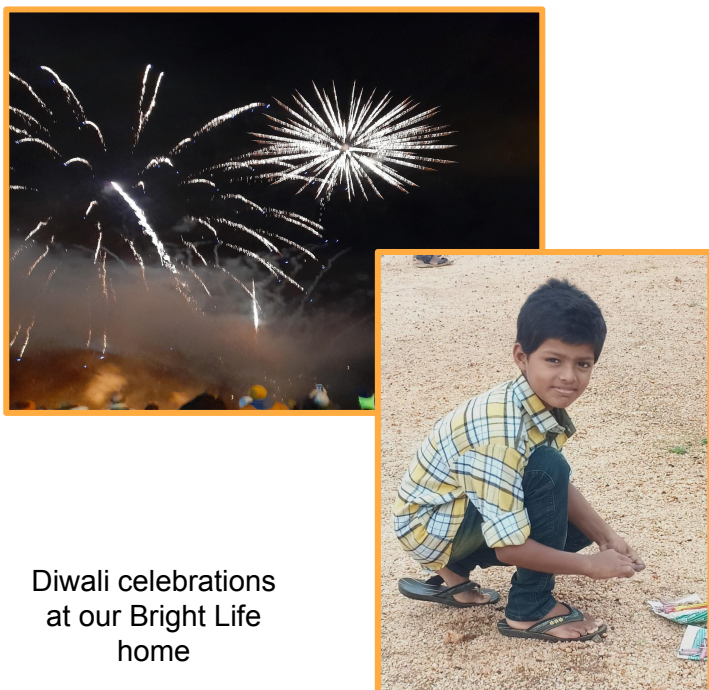
Diwali celebrations at our Bright Life home

Diwali is always a special highlight of the year in India, and we make sure we can send an additional amount (usually donated by one of our kind supporters) for the traditional new set of clothes, 'party food' and fireworks. The photo shows one of our boys getting the fireworks ready.