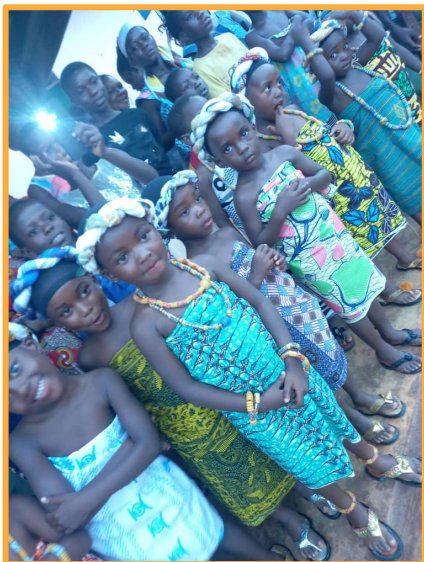
A cultural event at our Asiakwa school