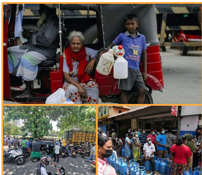
The daily reality of life in a country declared bankrupt