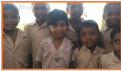
New arrivals at Brighter Life

annual exam, at the end of each school year, in order to progress to the next school year.