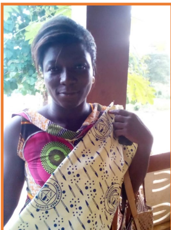
A happy mother receives her child's uniform material in Ghana

One of the most heart-warming things about our work with Star Action over the past thirteen years since we started our little charity has been the appreciation we have received from people we have been able to help - thanks to your support. As you may know, we began our work in Sri Lanka just after the terrible tsunami wave devastated parts of the south and east coast of this beautiful little island, which was also still suffering from years of civil war. Now, thankfully, the war is over but there remain many repercussions from this time, many bereaved families and traumatised people. The Tamil people in the war-torn area are still suffering inequality of opportunity, and lack of education, even in the basics of the language of the whole country (Sinhala), and this is one reason why we have been focusing recently on our education projects, as well as helping particularly sad and broken families and individuals in need of urgent medical help. (No National Health service or health insurance schemes for the poor here!)