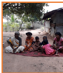
The poor family

During this trip we were taken to another very poor village to see an absolutely destitute family, with broken down home, so poor they had to sell their only asset, a goat, to pay for uniforms for the two youngest children to start school. In addition grandfather has a serious eye condition and mother and one other child are mentally retarded. Oh dear! Thanks to wonderful offers of help, we have already given a replacement goat, new clothes, offered medical treatment, and melon seeds to grow a cash crop on their land.