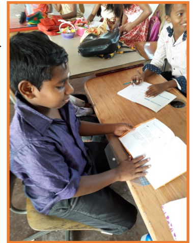
An eager Sinhala pupil