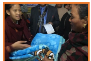
Nepal Blankets for the Blind