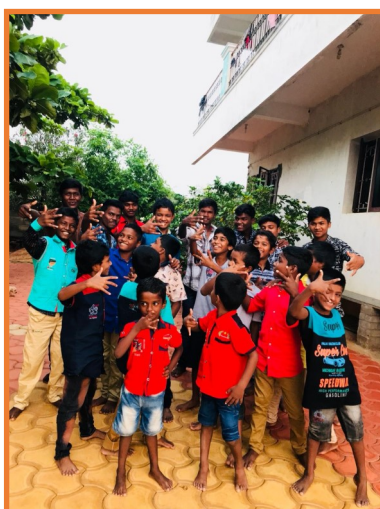
Boys at Brighter Life Children's Home

The sole activity we operate in India was the first of the many projects begun by Star Action. Starting in 1996 The Brighter Life Children's Home now cares for over 30 underprivileged children in the southernmost state of Tamil Nadu.