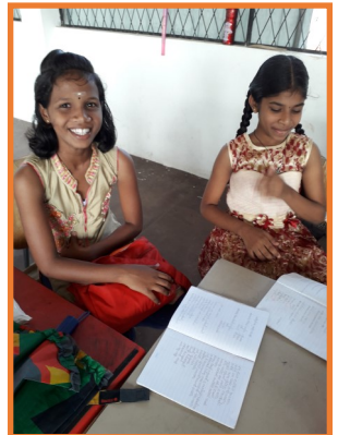
Hardworking pupils at our Sinhala school