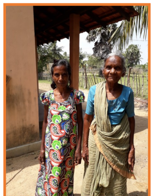
Elderly widow and daughter