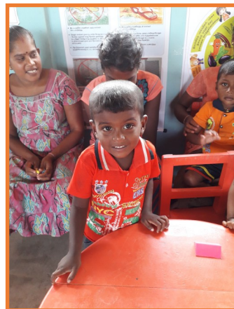
A happy nursery school pupil

In an even more remote location where memory of the civil war devastation is vivid, we are so happy to be able to help two more small nursery schools—in Vakaneri (currently 26 pupils) and in Kudamumakal (25 pupils). In both schools we pay the teachers' salaries and this time were able to take gifts of toys, shoes and clothes. (Again thanks to the generosity of well wishers.)