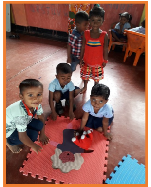
Happy play time

PS I first drafted this letter just before the tragic bombings in Sri Lanka. We are glad to report that no one involved with our Star Action work was killed or injured, but our latest reports from Rohan are that the whole country is still deeply traumatised and the income of many is affected by lack of tourist visitors, so our prayers and continuing support of all our projects are very much appreciated.