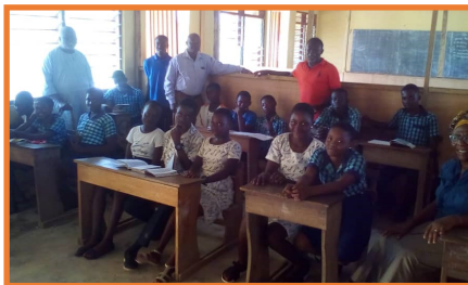
Observing a teaching session