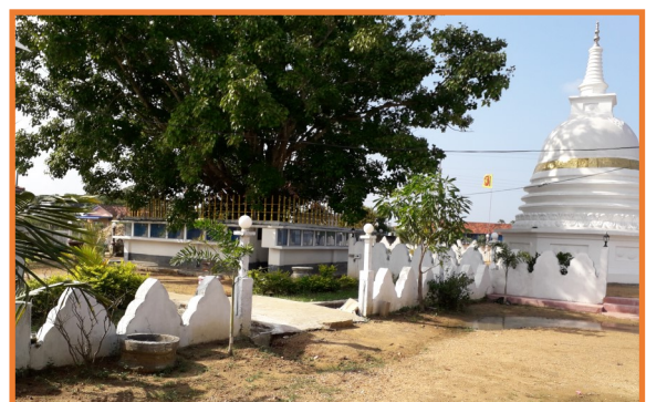
Peaceful ambience for one of our Sinhala schools