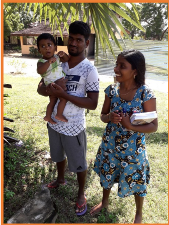
Our Sinhala teacher and new baby