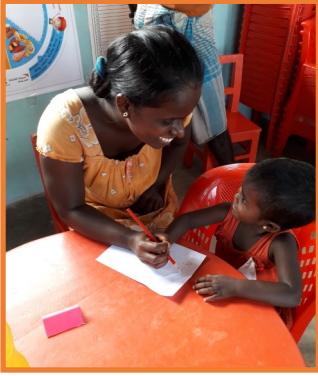
Happy teacher and pupil in one of our Nursery schools